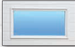
24" x 12"

Windows shown with white frames. All three models available in 1/2" Insulated Glass or 1/8" DSB.